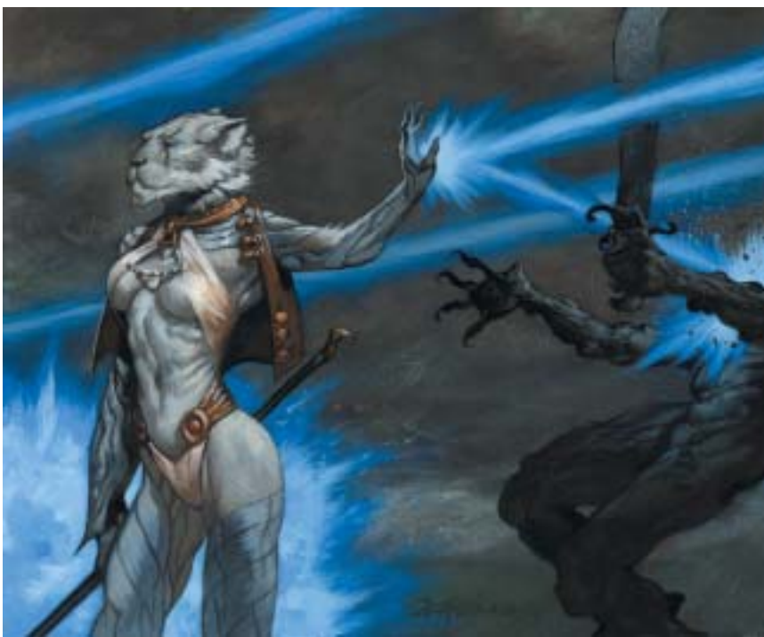
opposite: The Alex Cryss Chronicles conceptual art